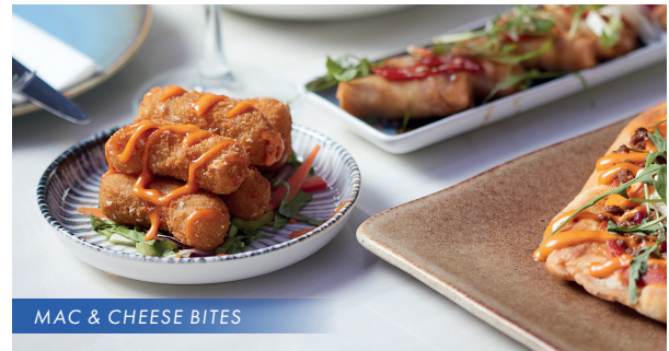
MAC & CHEESE BITES