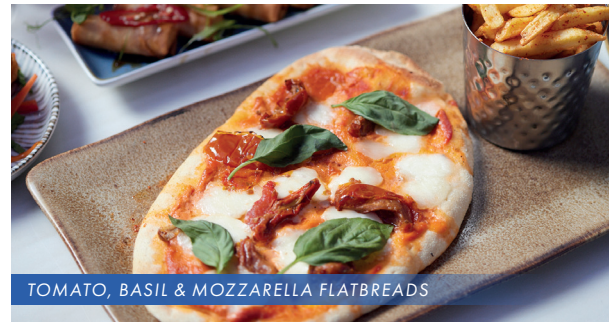
TOMATO, BASIL & MOZZARELLA FLATBREADS