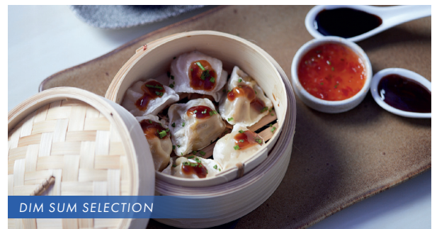
DIM SUM SELECTION

NOTE: A 12.5% DISCRETIONARY SERVICE CHARGE WILL BE ADDED TO YOUR BILL