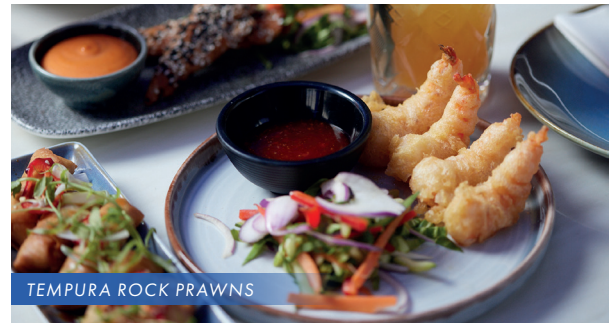
TEMPURA ROCK PRAWNS