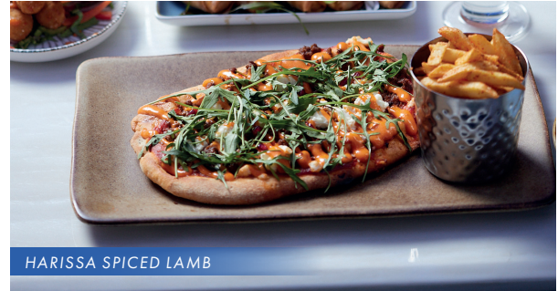
HARISSA SPICED LAMB