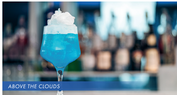
ABOVE THE CLOUDS

A BLEND OF MIDORI, CHAMBORD, LYCHEE LIQUEUR WITH WATERMELON SUGAR, APPLE & LEMON JUICE